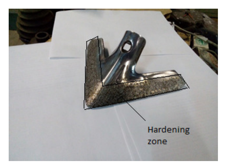
Fig 2.Lancet paw after coating